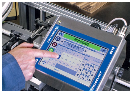
CLARiTY™ interface on Videojet printers

All Videojet solutions operate with one common and inherently simple user interface. The brightly colored CLARiTY™ touchscreen makes operating any Videojet product quick, easy and almost impossible to get wrong. The built-in Code Assurance software helps prevent human errors during data entry, and the menu structure offers intuitive navigation to reduce training requirements, so that all of your operators can feel confident during job set ups or changeovers.